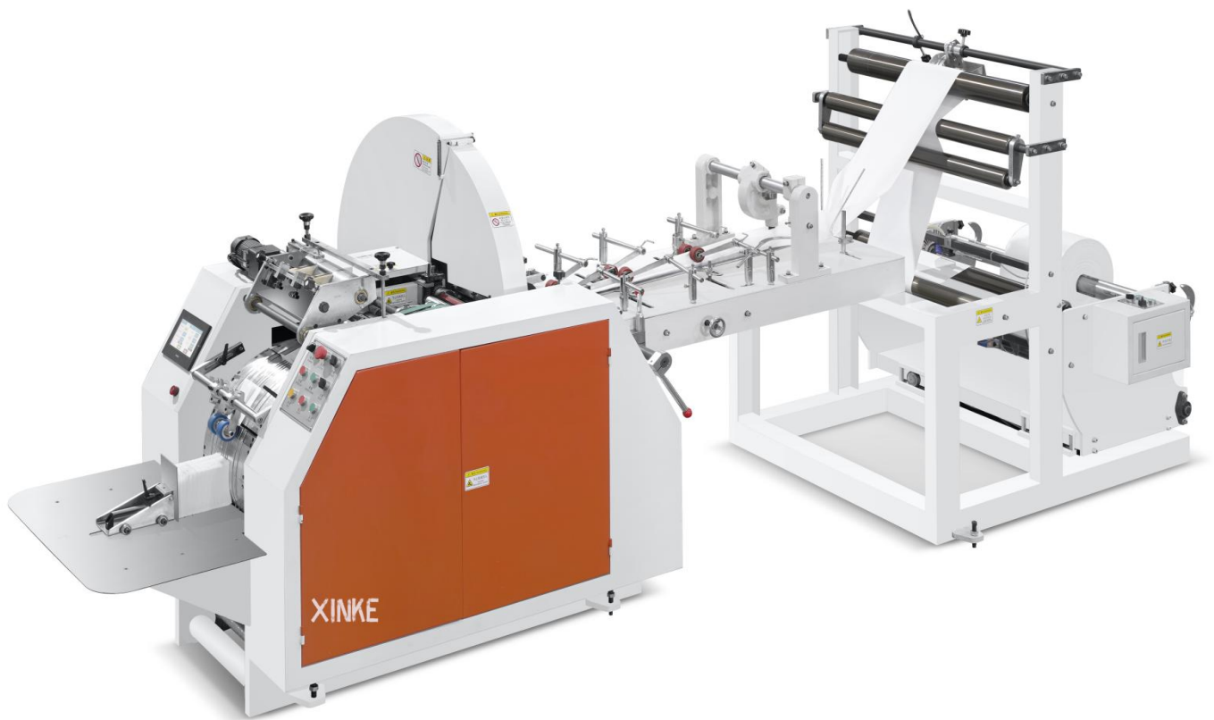
样品图片 SAMPLE PICTURE